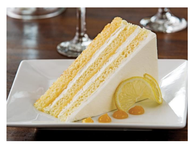
Super-Sized Lemon Cream Cake

Made from scratch shortcake layered between thick, dairy-fresh whipped cream and tangy lemon preserves.